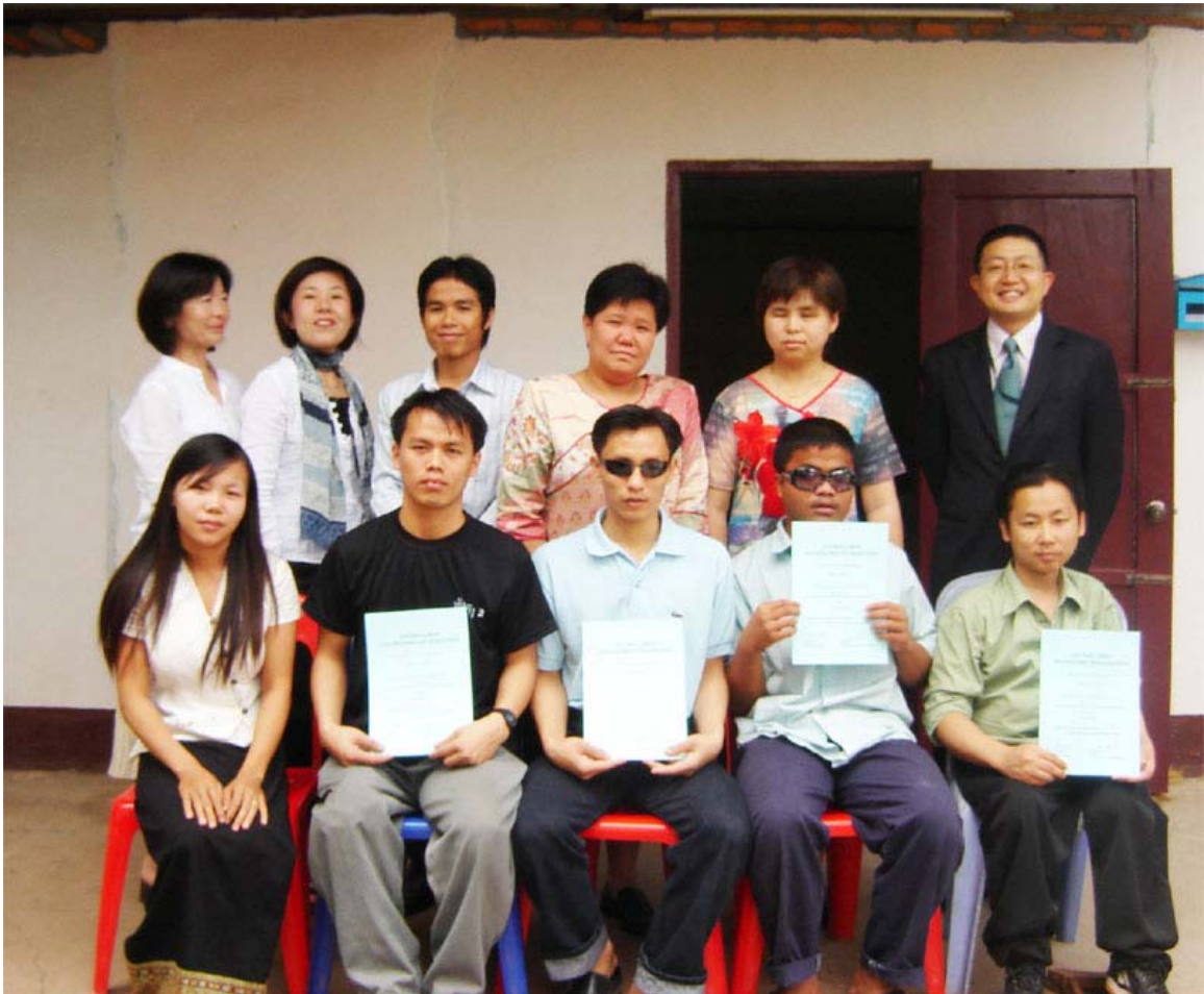
IT workshop of Lao Disabled People