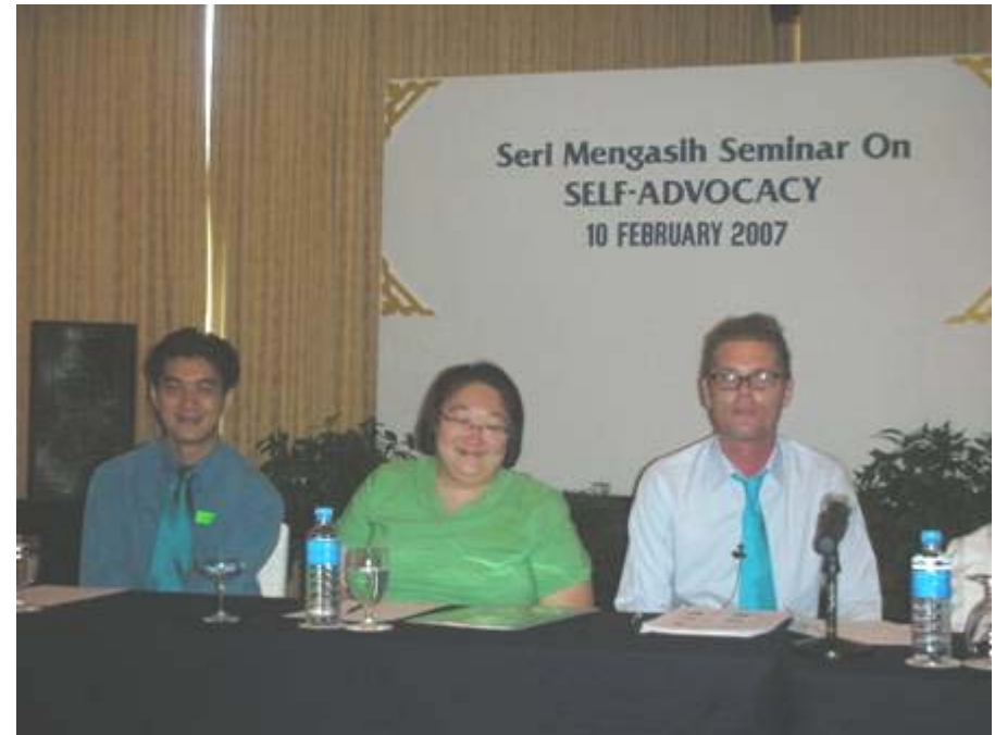
Kota Kinabalu, Sabah

Two new Self-Advocacy groups were formed in Sarawak after this event.