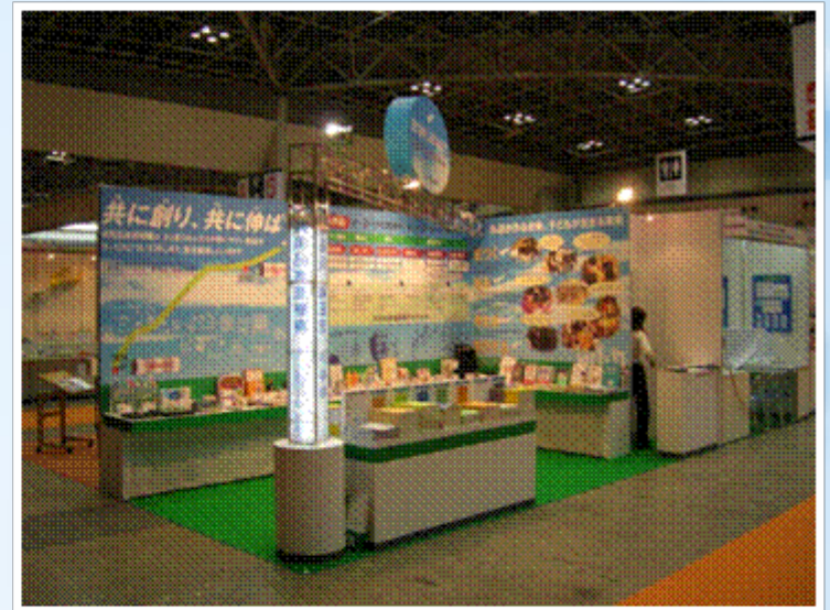
Int'l Exhibition (Tokyo)