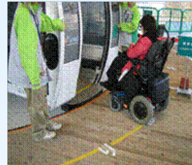
Verification of wheelchair accessibility