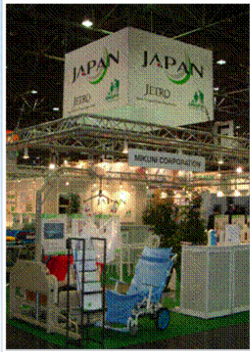
REHA CARE (Germany)