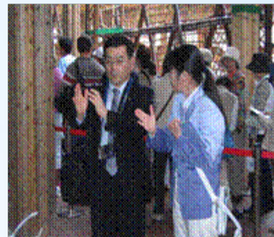
Sign language check-test