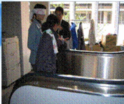
Guiding service for persons with visual impairment