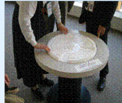
Verification of the tactual maps by persons with visual impairment